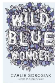
Wild Blue Wonder by Carlie Sorosiak