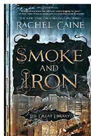
Smoke and Iron by Rachel Caine