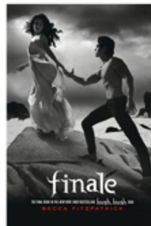
Finale by Becca Fitzpatrick (Hush, Hush Saga #4)