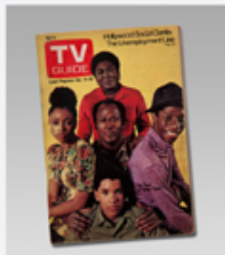
Exhibit is open to the public during regular library hours.

Through a compelling assortment of photographs, television, art posters, and historic artifacts, the exhibition traces how images and media disseminated to the American public transformed the modern civil rights movement and jolted Americans, both black and white, out of a state of denial or complacency.